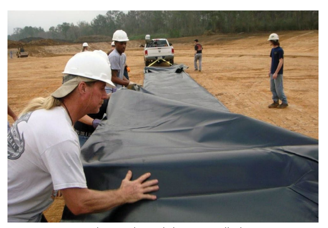
Fabricated panels being unrolled