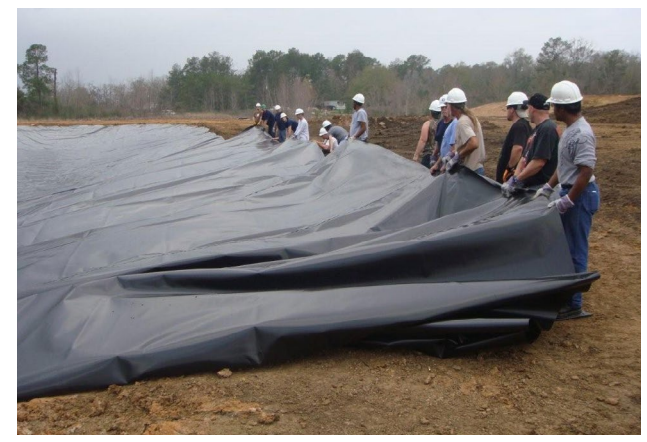
ArmorLiner panels easily deployed

LDF Construction, Inc. had spent the week preparing the pond and the pad for deploying the liner. This meant fine grading and ensuring that there were no objects larger than a fist exposed in the soil. Items like the stick and the rock shown on the previous page had to be removed. Once the pond and pad were inspected and approved the liner was deployed.