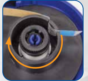
Loop liner through retainer and rotate counter-clockwise to tighten.