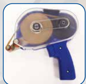
Close cover. Pull trigger to apply ATG to surface.