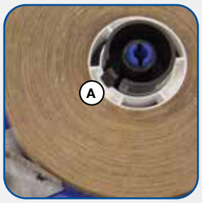
Place ATG tape in hub until hook (A) locks in place.