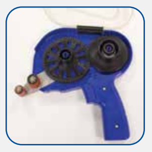
Start with opening the dispenser on a flat surface.