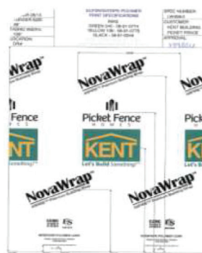
NovaWrap Logo Customer Logo #1 /#2 (can be stacked or side by side) NovaWrap Logo