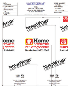
NovaWrap Logo Customer Logo NovaWrap Logo