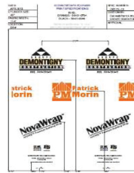
Customer Logo #1 Customer Logo #2 NovaWrap Logo