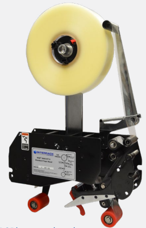
ET 2Plus tape head

When you compare features, benefits and value, Interpack Case Sealers are the right choice for operators, plant engineers, maintenance and purchasing.