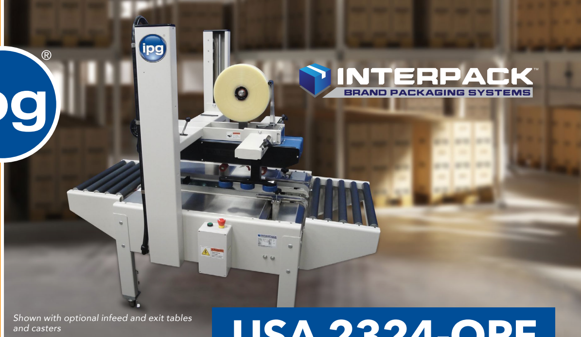
Shown with optional infeed and exit tables and casters