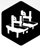
NUMBER OF MACHINES